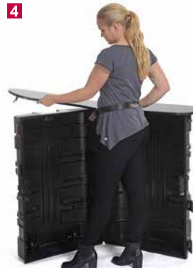
4 Unfold the counter top to the left side. Align and lock in place with the two latches, as in the previous step.