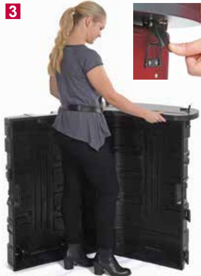
3 Mount the counter top on the right hand side of the case. Align the slot on the underside of the shelf and press/lock the two latches.