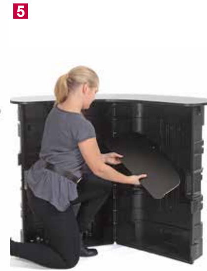
5 Attach the 4 inner shelves by inserting into the slots in the case.