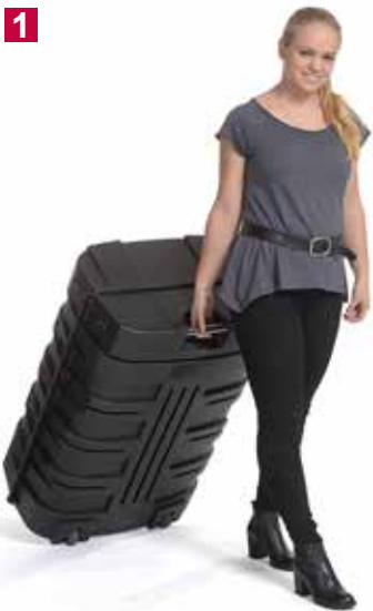
1 Expo Case has 2 wheels for easy transport.