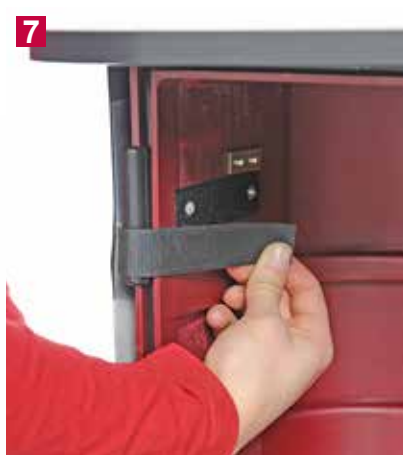
7 Wrap the graphic panel around the front side of the counter and connect it with the 4 velcro strips.