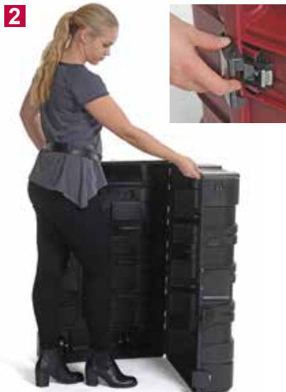
2 Release the latches to open the case – press in the gray inner portion and swing out the black clasp.