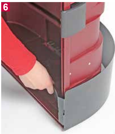
6 Attach the black kick-plate at the bottom of the desk.